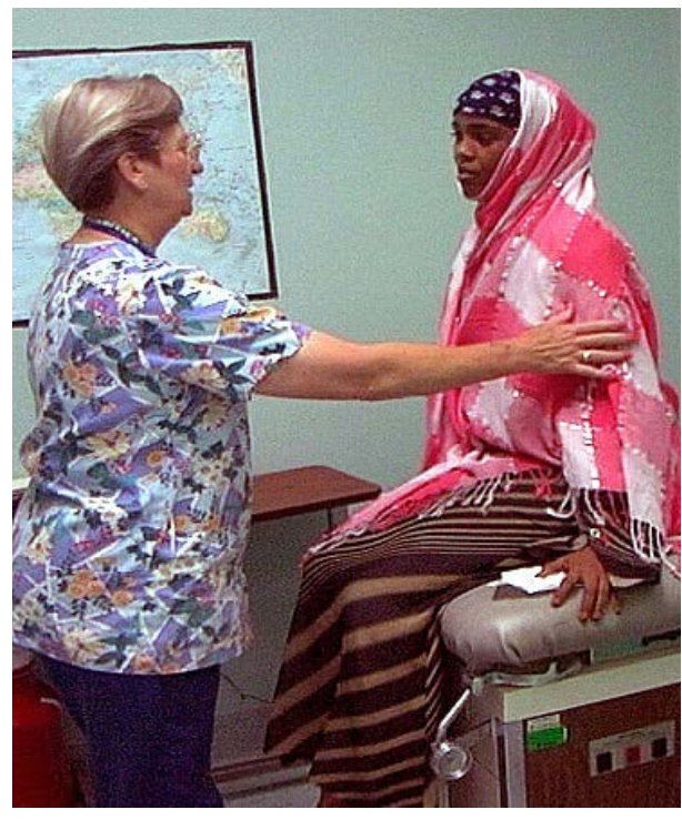
Health clinic or doctor's office