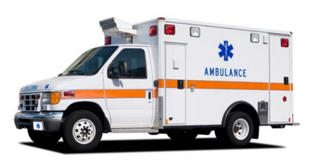
Emergency services and 9-1-1