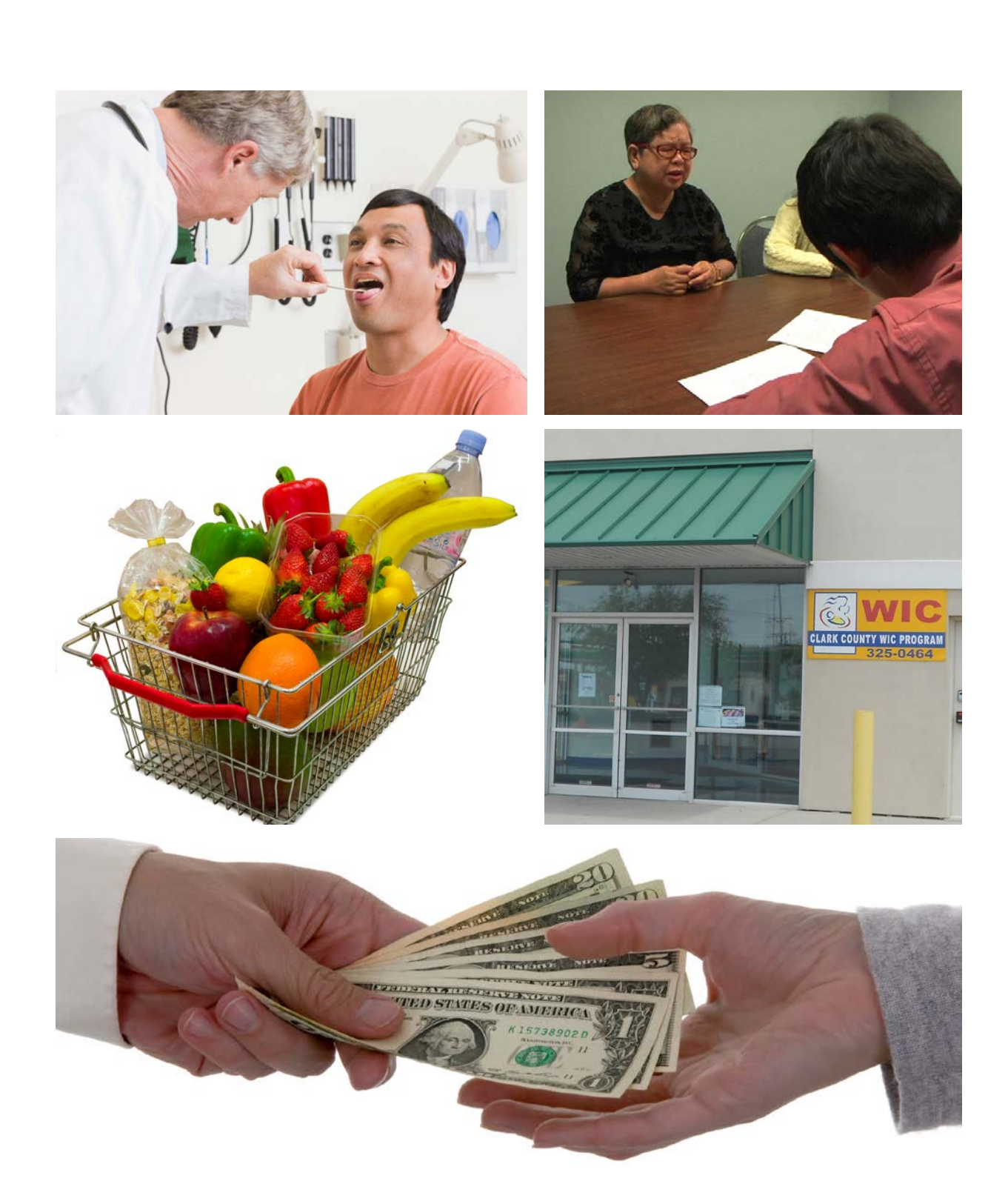
Government assistance office